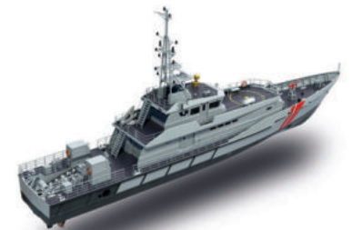
Security & Defence Division